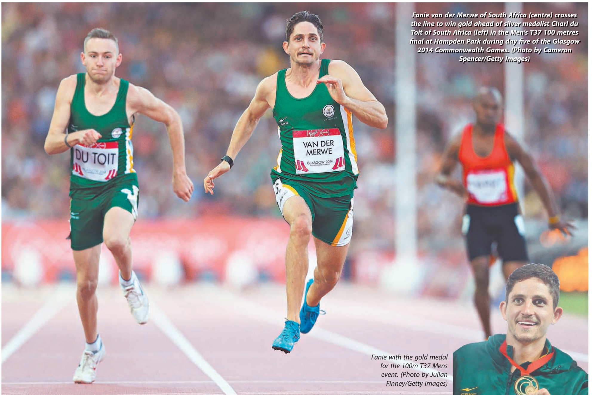
Fanie van der Merwe of South Africa (centre) crosses the line to win gold ahead of silver medalist Charl du Toit of South Africa (left) in the Men's T37 100 metres final at Hampden Park during day five of the Glasgow 2014 Commonwealth Games.