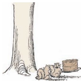
"Acorns or chocolate cake?"